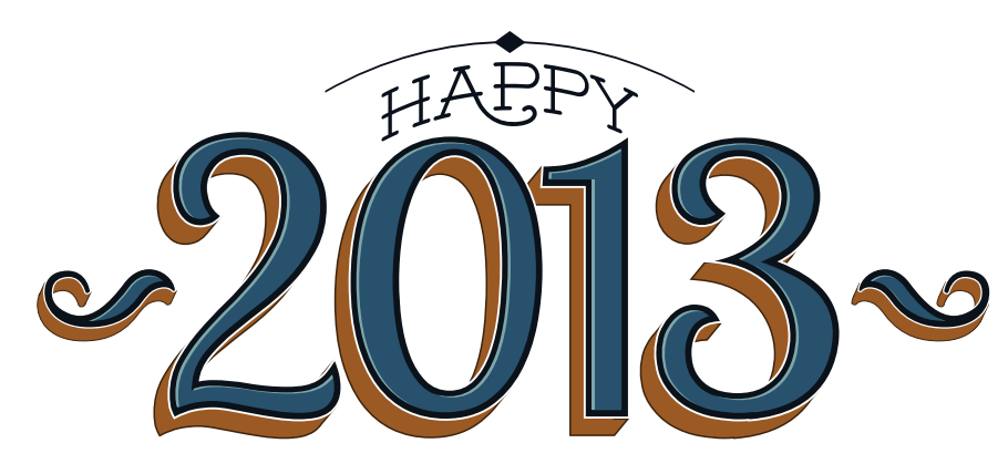
*NEW YEAR - NEW START *

Non Profit Organization U.S. Postage PAID Kamuela, Hawaii Permit No. 20