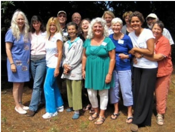
Volunteer Training, Spring 2012